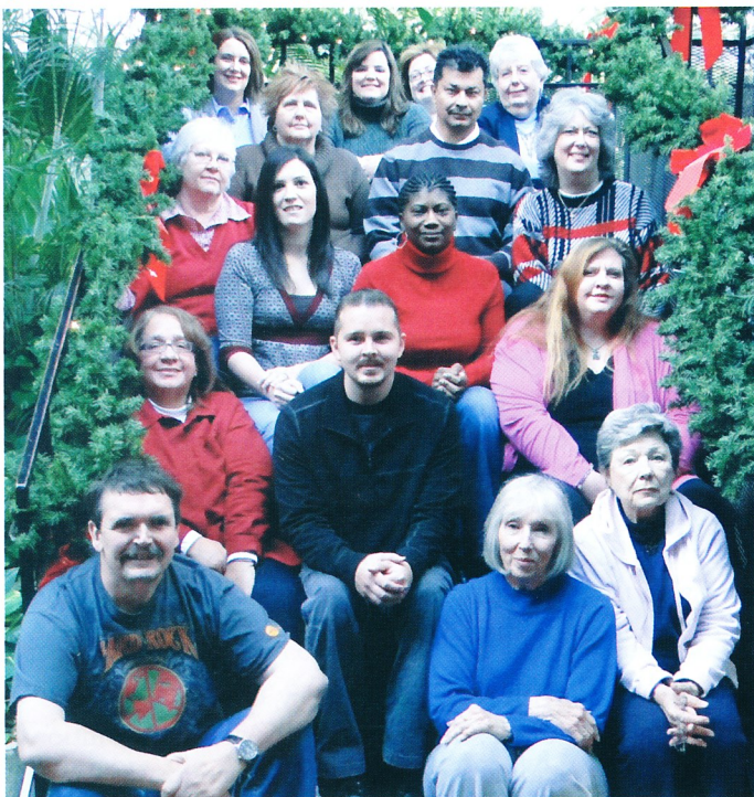
Greetings from the NDB Staff

There are many more questions, and we invite you to ask your own at RheumMD.org.